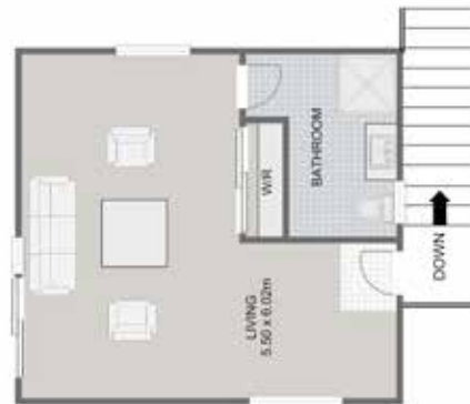
GARAGE LVL 1